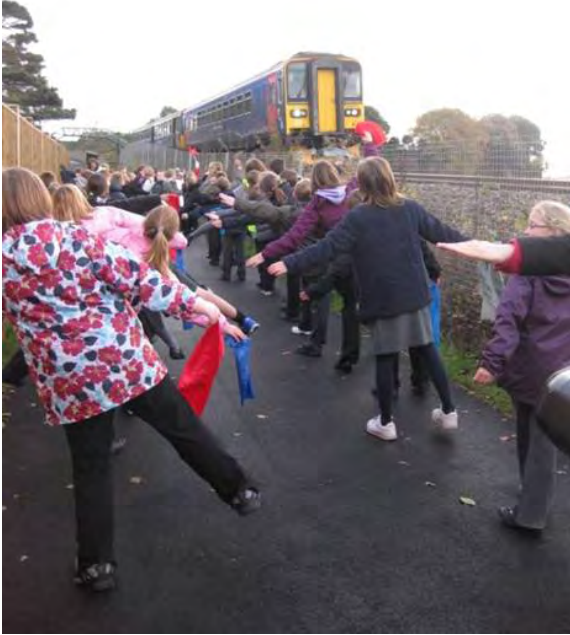
Pupils from Lypstone and Littleham Primary Schools performing their railway-inspired dance