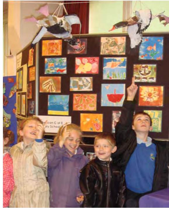
Pupils pointing out their work at the final exhibition at Elizabeth Hall, Exmouth, May 2011