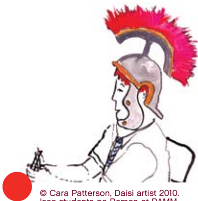
© Cara Patterson, Daisi artist 2010. Isca students go Roman at RAMM

Daisi and RAMM (Royal Albert Memorial Museum) organised creative writing workshops for Yr 7&8 students from four