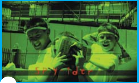
Making words matter through film at Queensway Primary School